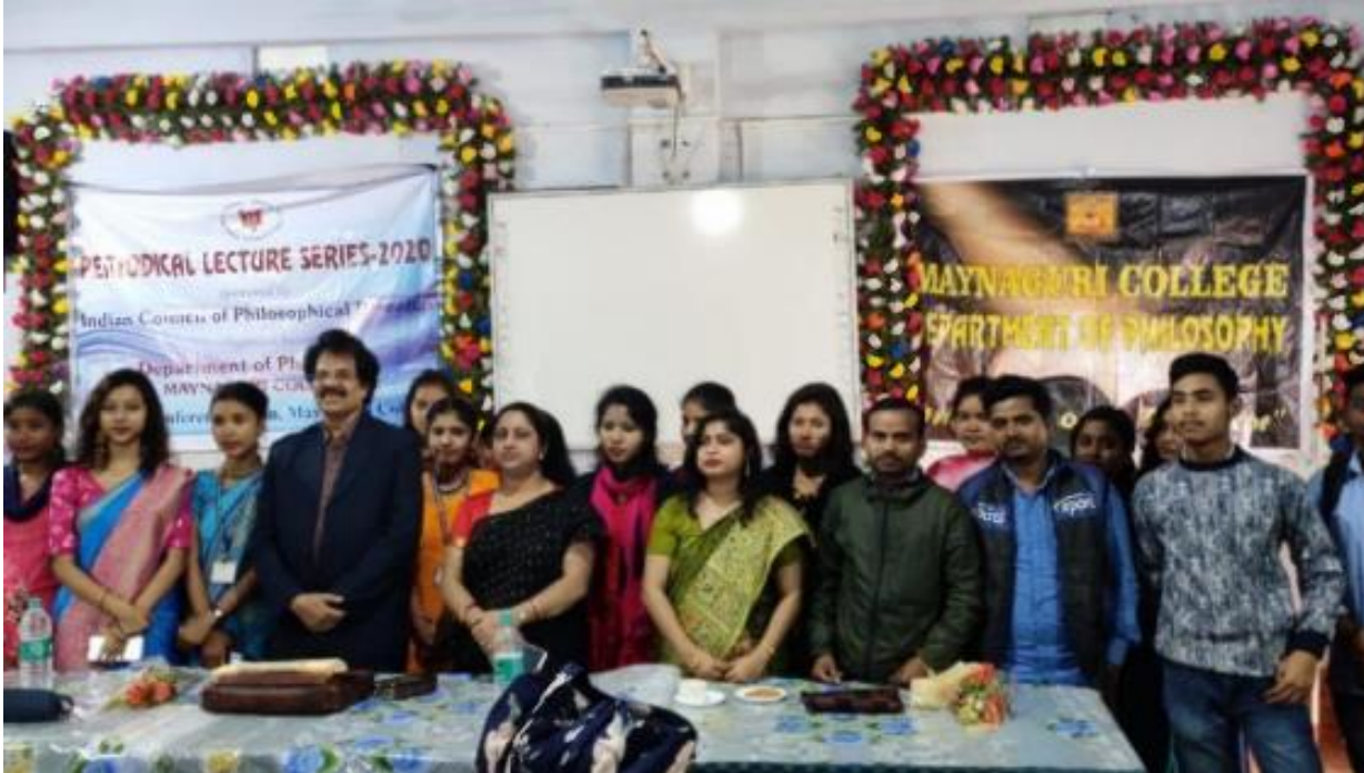
Report on National Webinar of Philosophy Department (4 th September, 2020)